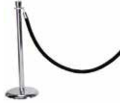
XT905 CHROME STANCHION/ XT906 ROPE Black, Red 12"Wx39"H rope 6'