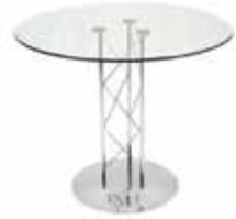
CT306 TRAVE TABLE Chrome/Glass 36"Dia.x30"H (Other sizes available)