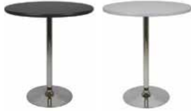
BT402 BAR HIGH TABLE Black, Grey, White 36"Dia.x42"H