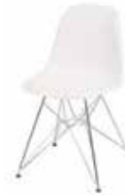
CH107 PARIS CHAIR White/Chrome 19"Wx22"Dx18"H