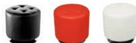
LG753 ROUND SWIVEL OTTOMAN Black, Orange, White 18" Dia.x17"H