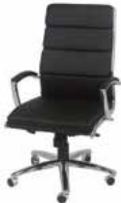
CO520 ZURICH HIGHBACK CHAIR Black, White 26"Wx21"Dx18-22"H