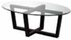
OT801 MONZA COCKTAIL TABLE Black 50"Wx32"Dx18"H