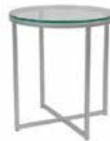
OT844 SPA END TABLE Silver/Glass 24"Dia.x24"H