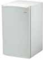
XT900 REFRIGERATOR 4.1 CF Black, White 19"Wx18"Dx32"H