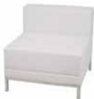
LG743 MAUI ARMLESS White 28"Wx28"Dx27"H