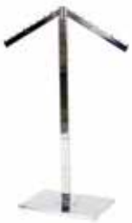
XT909 WATERFALL STAND Chrome - Adjustable 48"-72"H