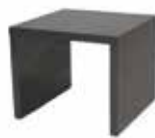
OT829 ABBY END TABLE Grey, White 24"Wx24"Dx20"H