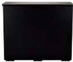
BT451 INFORMATION COUNTER Black, White - Locking 48"Wx20"Dx40"H