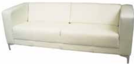
LG736 ASPEN SOFA White 82"Wx31"Dx28"H