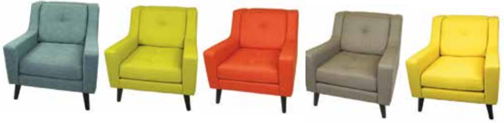
LG723 DANE CHAIR Blue, Green, Orange, Taupe, Yellow 34"Wx41"Dx34"H