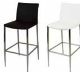
ST216 BELLA STOOL Black, White 17"Wx19"Dx30"H