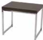
OT842 GIO END TABLE Black, Espresso 22"Wx16"Dx18"H