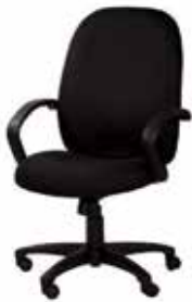
CO508 MIDBACK CHAIR Black 25"Wx24"Dx18-22"H