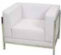
LG742 MAUI ARM CHAIR White 35"Wx29"Dx27"H