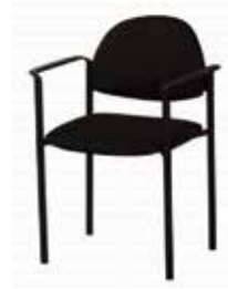
CO510 STACKABLE ARM CHAIR Black 24"Wx20"Dx18"H