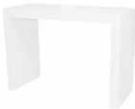
BT454-P W/POWER Black, White 56"Wx24"Dx40"H