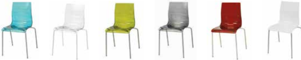
CH109 LIQUID CHAIR Blue, Clear, Green, Grey, Red, White 20"Wx18"Dx18"H