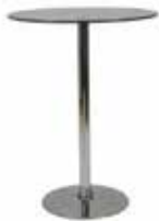
BT413 MARTINI BAR TABLE Chrome/Glass 32"Dia.x42"H