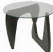
OT859 KAI END TABLE Black/Glass 26"Dia.x22"H