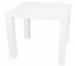
CT314 ABBY CAFE TABLE White 36"Wx36"Dx30"H