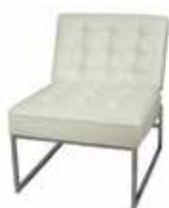
LG747 ANTON CHAIR Pearl 26"Wx33"Dx32"H