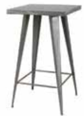
BT412 RETRO BAR TABLE Steel 24"Sq.x42"H