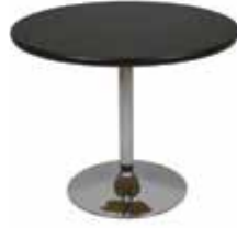
CT302 CAFE TABLE Black, Grey, White 36"Dia.x30"H