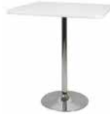
BT404 / BT405 SQUARE BAR TABLE Black, White 30"Sq.x42"H or 36"Sq.x42"H