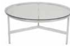
OT860 FIJI COCKTAIL TABLE Chrome/Glass 36"Dia.x17"H