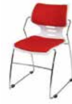
CH103 CAZMA CHAIR Black, Red 22"Wx22"Dx18"H