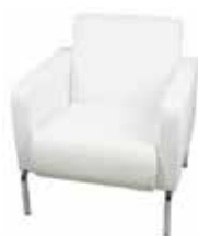
LG709 PRATO ARM CHAIR Black, White 29"Wx28"Dx33"H