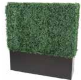
XT946 BOXWOOD WALL DIVIDER Green 48"Wx16"Dx48"H