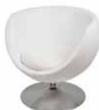
LG785 LARGO CHAIR White 30"Wx26"Dx28"H