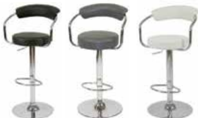
ST218 EURO STOOL Black, Grey, White - Adjustable 20"Wx17"Dx24-33"H