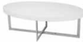
OT814 PALMA COCKTAIL TABLE Walnut, White 47"Wx24"Dx16"H