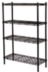
XT923/XT924 METAL SHELVING Black, Chrome 36"Wx14"Dx54"H or 36"Wx18"Dx72"H