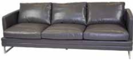
LG733 TRIBECA LEATHER SOFA Grey 89"Wx36"Dx33"H