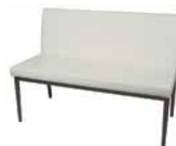
LG749 TICINO SETTEE White 48"Wx24"Dx34"H