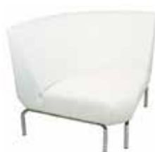
LG711 PRATO CORNER SECTIONAL Black, White 32"Wx32"Dx33"H