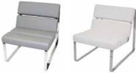
LG729 MIAMI CHAIR Grey, White 27"Wx31"Dx30"H