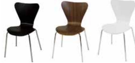
CH114 TENDY CHAIR Black, Walnut, White 17"Wx18"Dx18"H