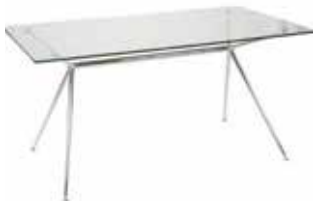
CT353 ALTOS TABLE Chrome/Glass 60"Wx36"Dx30"H