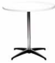
CT301 PEDESTAL TABLE Black, White 30"Dia.x30"H