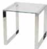
OT818 KEMI END TABLE Chrome/Glass 22"Wx22"Dx22"H