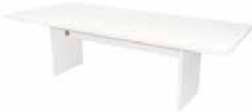
CF609 RECTANGULAR CONFERENCE TABLE Black, White 96"Wx42"Dx30"H