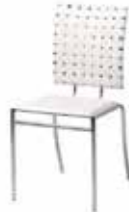
CH106 CRISS CROSS White/Chrome 17"Wx19"Dx18"H