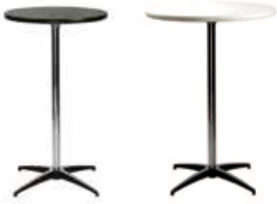
BT400 / BT401 BAR PEDESTAL TABLE Black, White 24"Dia.x42"H or 30"Dia.x42"H