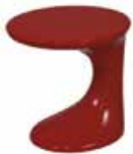
OT822 SPLIT SIDE TABLE Black, Red, White 15"Wx18"Dx18"H