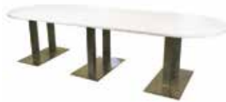
CF610 OVAL CONFERENCE TABLE Black, White 120"Wx42"Dx30"H