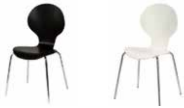
CH100 JACOBSON CHAIR Black, White 18"Wx17"Dx18"H