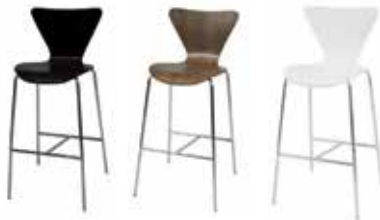
ST214 TENDY STOOL Black, Walnut, White 17"Wx17"Dx30"H