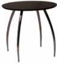
CT307 BISTRO TABLE Black, Natural, White 30"Dia.x30"H