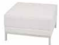
LG745 MAUI OTTOMAN White 28"Wx28"Dx17"H