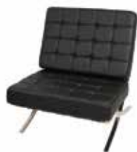
LG717 IBIZA CHAIR Black, White 30"Wx33"Dx33"H