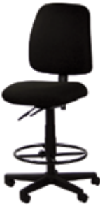
CO513 TASK STOOL Black, Adjustable 19"Wx22"Dx23-27"H