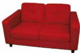
LG713 SOLO LOVESEAT Black, Red 57"Wx35"Dx32"H