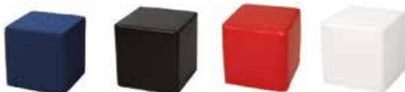
LG755 BLOCK OTTOMAN Blue Microfiber, Black, Red, White Leatherette 18"Wx18"Dx18"H