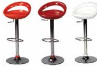
ST208 TICKLE STOOL Orange, Red, White - Adj. 19"Wx21"Dx23-31"H