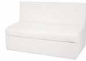
LG732 SOHO LOVESEAT White 48"Wx24"Dx31"H