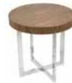
OT815 PALMA END TABLE Walnut, White 22 Dia.x22"H