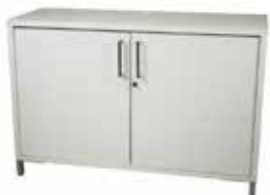
OF659 STORAGE CREDENZA White 48"Wx18"Dx33"H