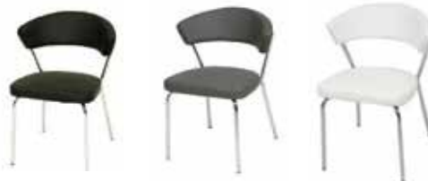
CH118 EURO CHAIR Black, Grey, White 22"Wx21"Dx18"H