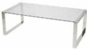
OT817 KEMI COCKTAIL TABLE Chrome/Glass 48"Wx24"Dx16"H