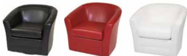
LG780 STEN SWIVEL CHAIR Black, Red, White 32"Wx32"Dx29"H