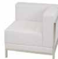
LG744-R MAUI CORNER White 28"Wx28"Dx27"H