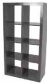
XT925 CUBE SHELF Grey, White 31"Wx15"Dx58"H