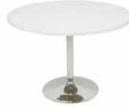
CT303 CAFE TABLE Black, Grey, White 42"Dia.x30"H