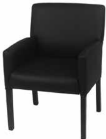
CO518 RECEPTION CHAIR Black 24"Wx26"Dx36"H