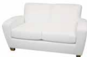
LG707 SCANDIC LOVESEAT Black, Red, White 59"Wx34"Dx30"H