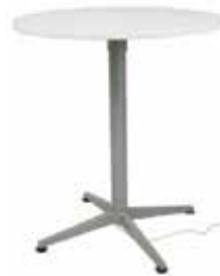
BT408 POWER BAR TABLE White 36"Dia.x42"H