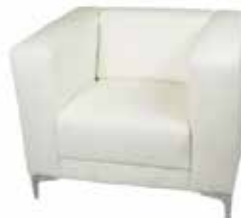
LG737 ASPEN CHAIR White 36"Wx31"Dx28"H