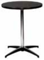
CT300 PEDESTAL TABLE Black, White 24"Dia.x30"H