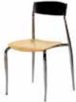
CH104 TOLEDO CHAIR Natural/Chrome 17"Wx19"Dx18"H