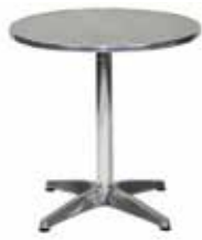
CT311 CHROMA TABLE Aluminum 27"Dia.x30"H