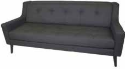
LG722 DANE SOFA Grey 80"Wx41"Dx34"H