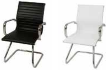
CO501 OTTO GUEST CHAIR Black, White 22"Wx24"Dx18"H