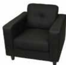
LG714 SOLO CHAIR Black, Red 34"Wx35"Dx32"H