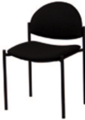
CO509 STACKABLE SIDE CHAIR Black 20"Wx20"Dx18"H