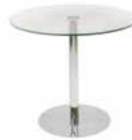
CT313 MARTINI TABLE Chrome/Glass 36"Dia.x30"H