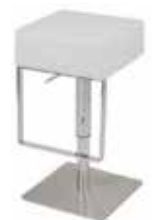
ST219 TECH STOOL White - Adjustable 15"Wx15"Dx22-29"H