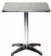
CT310 CHROMA TABLE Aluminum 27sq.x30"H