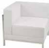
LG744-L MAUI CORNER White 28"Wx28"Dx27"H