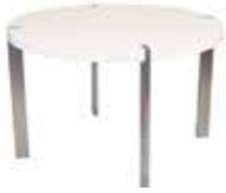
CF602 GLACIER CONFERENCE TABLE White-Gloss 47"Dia.x30"H