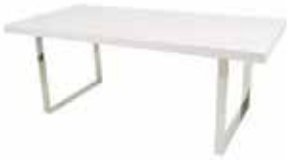
CF604 GLACIER CONFERENCE TABLE White-Gloss 79"Wx40"Dx30"H