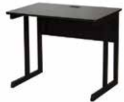
OF654 COMPUTER WORKSTATION Black 36"Wx24"Dx29"H