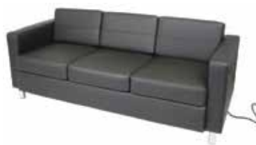
LG715 MALIBU SOFA WITH POWER Black, White 73"Wx31"Dx30"H