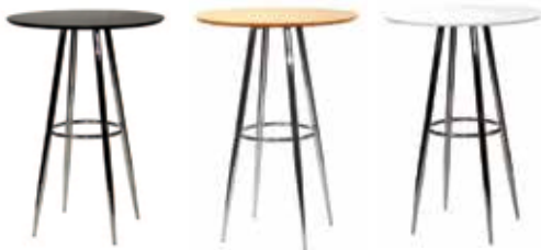
BT407 BRAVO BAR TABLE Black, Natural, White 30"Dia.x42"H