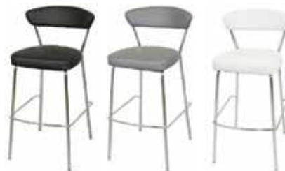
ST218-2 EURO 2 STOOL Black, Grey, White 20"Wx17"Dx33"H