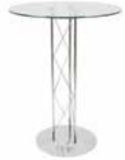
BT406 TRAVE BAR TABLE Chrome/Glass 32"Dia.x42"H (Other sizes available)