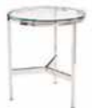
OT861 FIJI END TABLE Chrome/Glass 20"Dia.x23"H