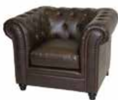
LG702 HAVANA CHAIR Brown 43"Wx38"Dx34"H