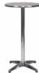
BT410 CHROMA BAR TABLE Aluminum 23"Dia.x42"H