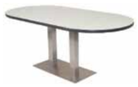
CF606 / CF608 CONFERENCE TABLE Black, Grey, White 72"Wx36"Dx30"H or 96"Wx42"Dx30"H