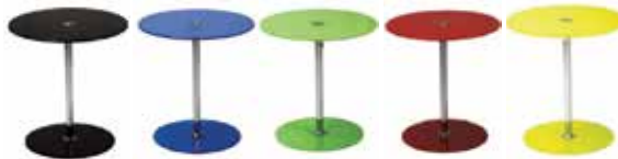
OT821 VEGA TABLE 18" DIA. Black, Blue, Green, Red, White, Yellow - Adjustable 18"Dia.x19-31"H