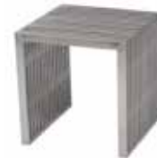
OT840 LINEAR END TABLE Steel 15"Wx15"Dx16"H