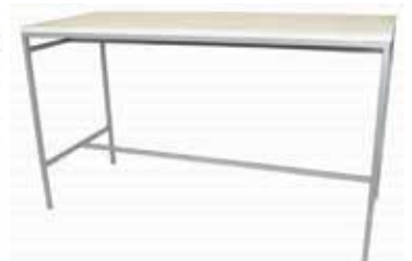
BT457-P W/POWER Black, White 72"Wx30"Dx42"H