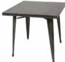
CT312 RETRO TABLE Steel 32"Wx32"Dx30"H