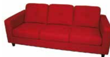
LG712 SOLO SOFA Black, Red 80"Wx35"Dx32"H