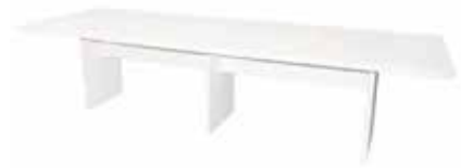
CF611 RECTANGULAR CONFERENCE TABLE Black, White 120"Wx42"Dx30"H

Additional conference table sizes, colors and power options available. Contact your sales rep for information.