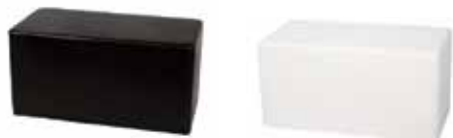
LG757 RECTANGLE OTTOMAN Black, Silver, White Leatherette 36"Wx18"Dx18"H