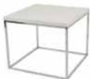
OT856 KLUB END TBL. White 24"Wx24"Dx18"H