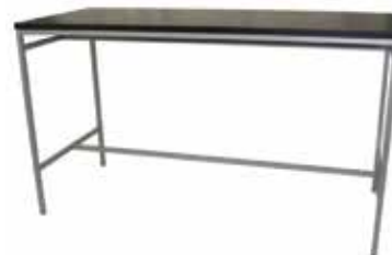
BT457 EDGE COMMUNAL BAR TABLE Black, White 72"Wx30"Dx42"H