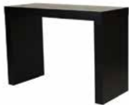
BT454 BALI BAR Black, White 56"Wx24"Dx40"H