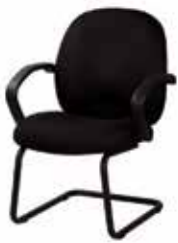
CO507 GUEST CHAIR Black 25"Wx25"Dx18"H