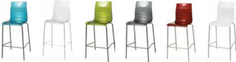
ST209 LIQUID STOOL Blue, Clear, Green, Grey, Red, White 19"Wx20"Dx30"H