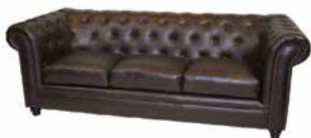
LG700 HAVANA SOFA Brown 93"Wx38"Dx34"H