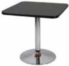
CT304 SQUARE CAFE TABLE Black, White 30"Sq.x30"H