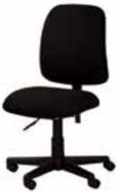
CO512 TASK CHAIR Black 19"Wx22"x18-22"H