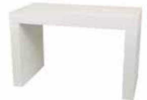
OF671 BALI DESK Black, White 48"Wx24"Dx31"H