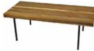
OT804 TUSCAN COCKTAIL TABLE Teak 48"Wx21"Dx16"H