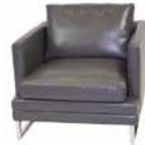
LG735 TRIBECA LEATHER CHAIR Grey 34"Wx36"Dx33"H