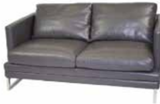
LG734 TRIBECA LEATHER LOVESEAT Grey 61"Wx36"Dx33"H