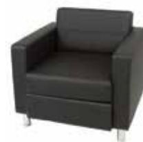
LG716 MALIBU CHAIR WITH POWER Black, White 32"Wx31"Dx29"H