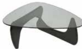
OT858 KAI COCKTAIL TABLE Black/Glass 36"Wx40"Dx15"H