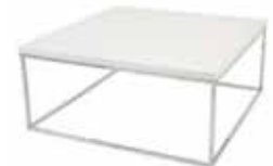
OT855 KLUB COCKTAIL TBL. White 36"Wx36"Dx15"H