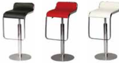
ST203 EQUINO STOOL Black, Red, White - Adj. 14"Wx17"Dx26-30"H