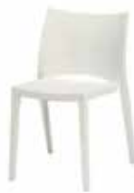
CH113 LESLIE CHAIR White 19"Wx21"Dx18"H