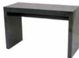
OF670 PARSON DESK Grey, White 48"Wx24"Dx29"H