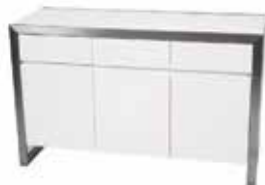
OF660 GLACIER SIDEBOARD White-Gloss 48"Wx18"Dx30"H