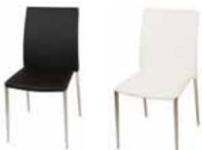
CH116 BELLA CHAIR Black, White 18"Wx20"Dx19"H