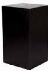
XT919 CUBE PEDESTAL Black, White 24"Wx24"Dx42"H