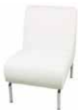
LG710 PRATO ARMLESS SECTIONAL Black, White 22"Wx28"Dx33"H