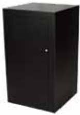
XT916 COMPUTER PEDESTAL Black, White - Locking 24"Wx24"Dx42"H