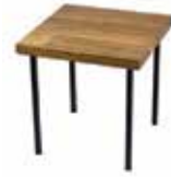
OT805 TUSCAN END TABLE Teak 18"Wx18"Dx18"H