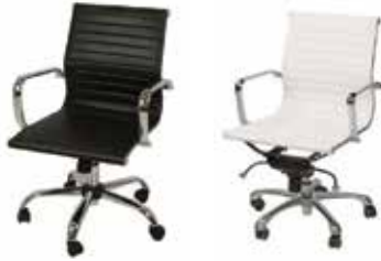
CO502 OTTO CHAIR Black, White 22"Wx24"Dx18-21"H