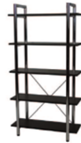
XT922 LAURENCE SHELF Black, White 35"Wx15"Dx72"H