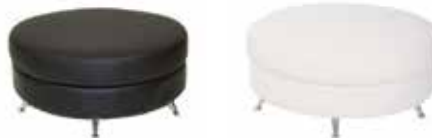
LG760 CAPRI OTTOMAN Black, White 40" Dia.x18"H