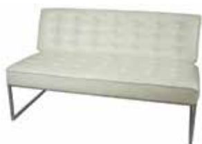
LG746 ANTON LOVESEAT Pearl 58"Wx33"Dx32"H