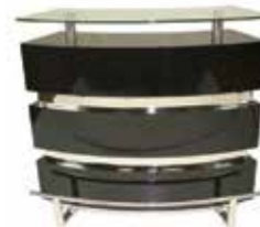
BT453 MILANO BAR Black, White 48"Wx20"Dx42"H