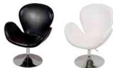
LG786 SWAN CHAIR Black, White 29"Wx28"Dx35"H