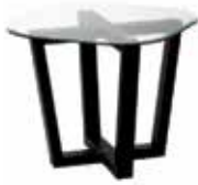
OT802 MONZA END TABLE Black 25"Wx25"Dx21"H