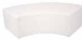
LG731 SOHO CURVED BENCH White 52"Wx22"Dx17"H