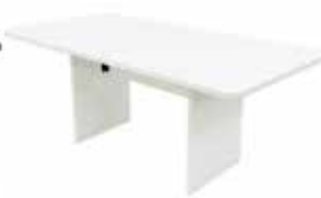
CF605 RECTANGULAR CONFERENCE TABLE Black, Cognac, Maple, White 72"Wx36"Dx30"H