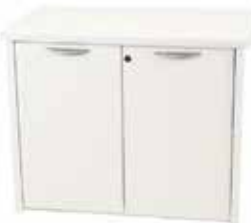
OF653 STORAGE CABINET Black, White - Locking 37"Wx20"Dx29"H