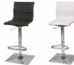
ST210 OTTO STOOL Black, White 16"Wx18"Dx24-30"H