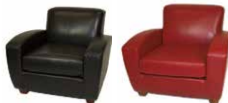
LG708 SCANDIC CHAIR Black, Red, White 38"Wx34"Dx30"H