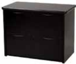
OF652 LATERAL FILE Black - Locking 36"Wx24"Dx29"H