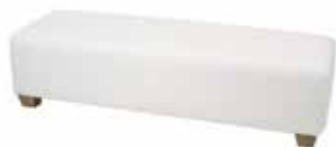
LG750 BENCH OTTOMAN Black, White 60"Wx20"Dx17"H