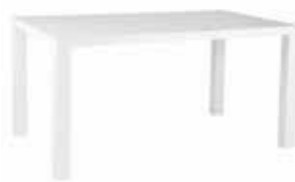
CT355 ABBY TABLE White 63"Wx36"Dx30"H